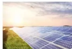
Energy Storage System